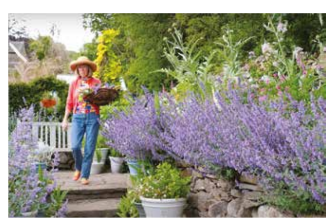
Both Virtual Garden Visits - many filmed by garden owners - and plant sales raised awareness and funds for the National Garden Scheme during lockdown

The creation and marketing of the Virtual Garden Visits video campaign placed considerable pressure on the reduced head office team who were all working remotely from home and it was a notable achievement to maintain