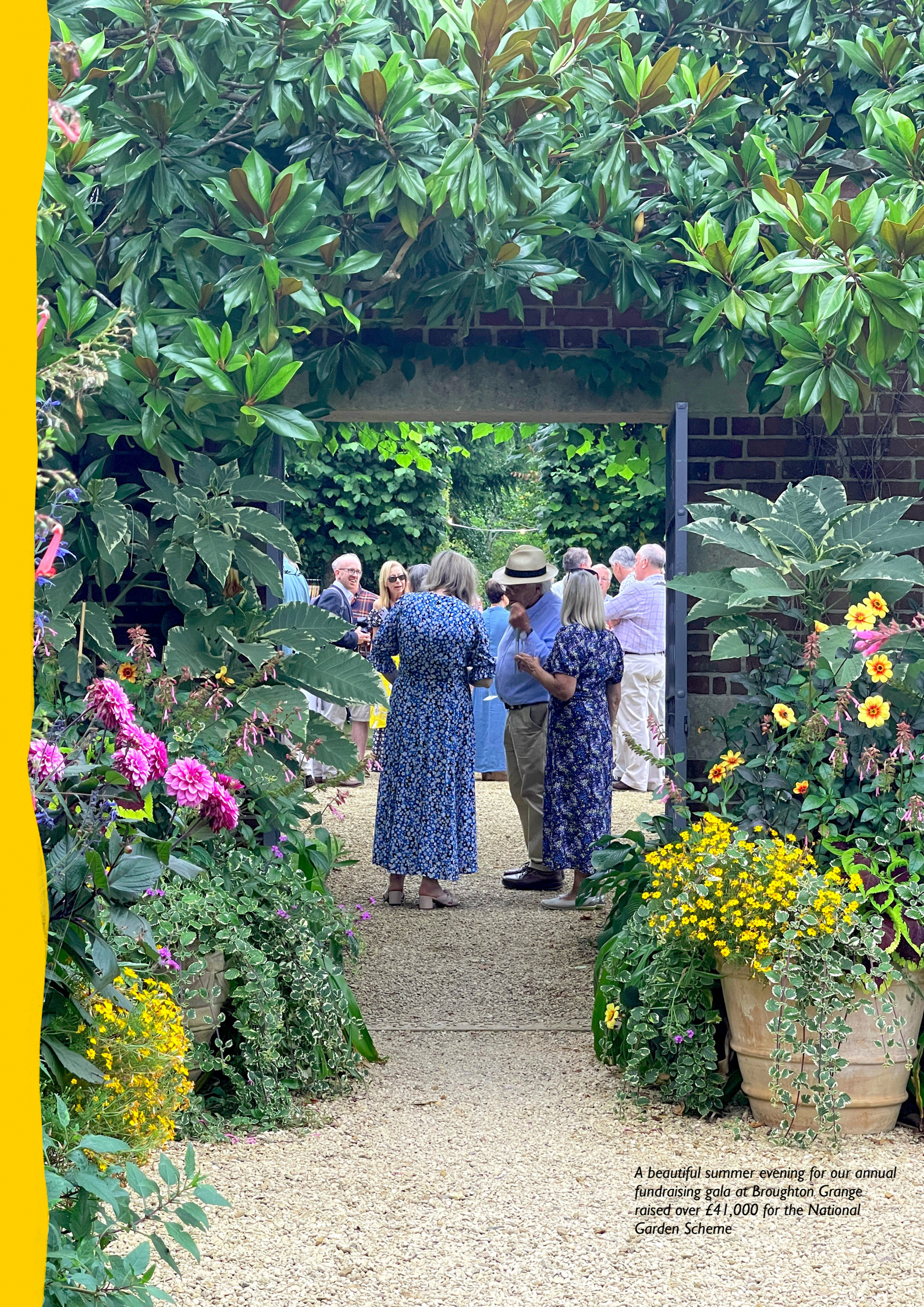
A beautiful summer evening for our annual fundraising gala at Broughton Grange raised over £41,000 for the National Garden Scheme